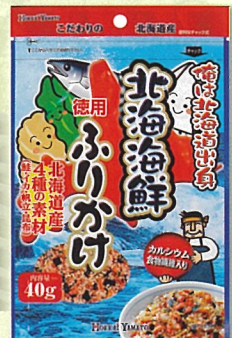
This furikake is full of the flavors of salmon, squid, scallop and kelp from the seas around Hokkaido. It is rich in calcium and vegetable fiber.