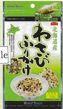
This Hokkaido wasabi-based furikake contains laver, rice crackers, sesame and aosa laver. Domestic hon-wasabi is also used to add a refreshing flavor and taste. This 30g product is contained in a zipped package.