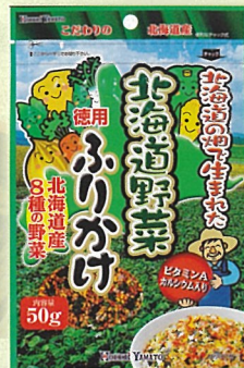
This furikake contains eight kinds of vegetables grown in Hokkaido (potato, pumpkin, Japanese radish leaf, carrot, sweet corn, onion, asparagus and spinach). It is rich in vitamin A and calcium.